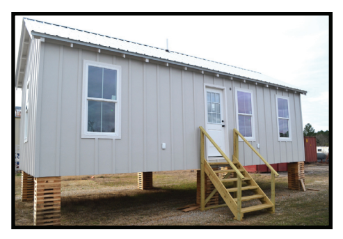
ALTERNATIVE HOUSING. Affordable housing has long been one of the most serious hindrances to the economic development of Tishomingo County.

For more information, call 662-205-0810 or visit the web site at www. emcontingencygroup.com.