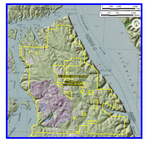
TRI-STATE COMMERCE PARK. 751 CR 989. luka. 3.500 acre/1.416 hectare county owned industrial complex with dual electric power, rail spur, barge dock, 24/7 security.