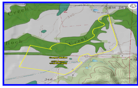
COOPER MARINE INDUSTRIAL PARK. 183 CR 1, Dennis, 90 & 70 acre/36 & 19 hectare privately owned sites on waterway and adjacent to a wood chip mill.