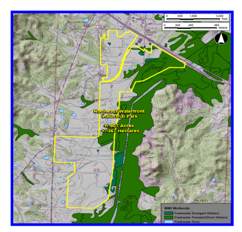
NORTHEAST MISSISSIPPI FRONT INDUSTRIAL PARK, 56 CR 219. Burnsville, 900 acre/364 hectare port owned industrial park with barge dock, four lane highway, & rail spur.