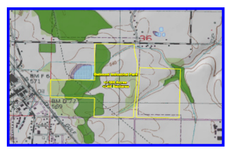
BELMONT INDUSTRIAL PARK. Yarber Street, Belmont, 100 acre/40 hectare city owned industrial park with municipal utilities. Additional acreage may be available.