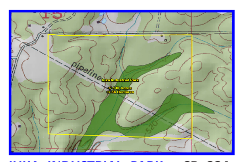
IUKA INDUSTRIAL PARK. CR 234, Iuka, 140 acre/57 hectare city owned industrial park with municipal utili-Federal Opportunity Zone. ties. Gated entrance.