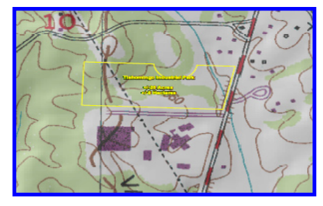
TISHOMINGO INDUSTRIAL PARK. 1425 Highway 25, Tishomingo, 20 acre/8 hectare city owned industrial park with municipal utilities. Technical training center adjacent.