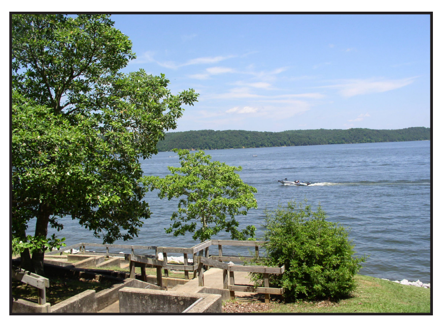
J. P. COLEMAN STATE PARK. J. P. Coleman State Park implemented a number of park improvement projects in 2023 including replacement of B dock and the fuel pump at the marina; replacement of numerous roofs throughout the park; replacement of flooring in cabins; and renovation of a townhouse in the hotel. Additional park improvements are scheduled for 2024.

With 50,000 acres of lakes, two state parks, several Corps of Engineer parks, seven marinas, the Tenn-Tom Waterway, several museums, the Natchez Trace Parkway, beautiful scenery, picturesque downtowns, several retirement & vacation communities, arts and crafts shops, the bargain tour, and lots of special events, tourism and retiree attraction have the greatest potential for growth and wealth creation for residents and local businesses of any economic sector in Tishomingo County. In Mississippi, tourism is the fourth largest economic sector.